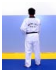
27)Step forward walking stance down block