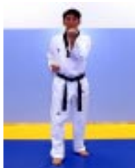
16) Step forward walking stance inside body block