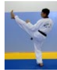
6) Front kick