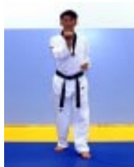
15) 90° turn left pivot on right foot walking stance inside body block