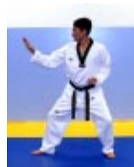
13) 180° turn right pivot on left foot back stance knifehand body block