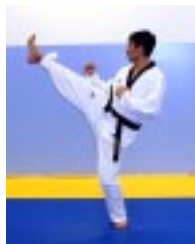
18) Front kick