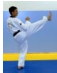
2) Front kick