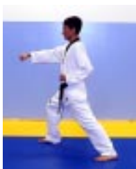
19) Land in front stance body punch