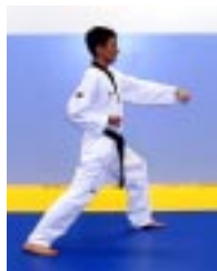
23)Land in front stance body punch