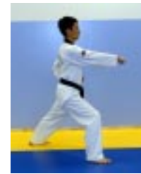
3) Land in front stance body punch