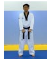
Turn 180° left pivot on right foot Finish position