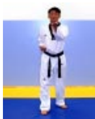
10) Step forward walking stance inside neck hit