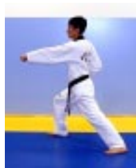
14) Step outward pivot on left foot front stance body punch