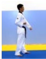
1) 90° turn left pivot on right foot walking stance down block