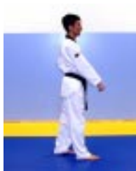
21)180° turn right pivot on left foot walking stance down block