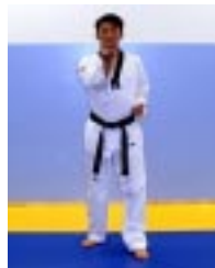
9) 90° turn left pivot on right foot walking stance inside neck hit