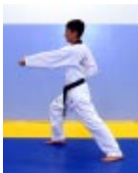
20) Body punch