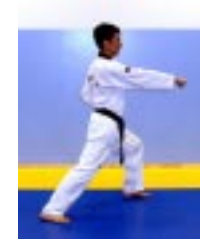
12) Step outward pivot on right foot front stance body punch