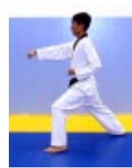
8) Body punch